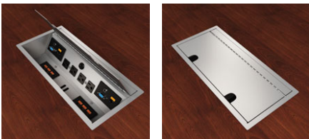
Daisy Link Large